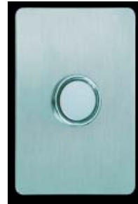
Figure 2 Hall Call Station

Hall Call Stations are installed at all landings to move the cab to the landing from which it is being called. An optional key switch limits the elevator's use to authorized persons only.