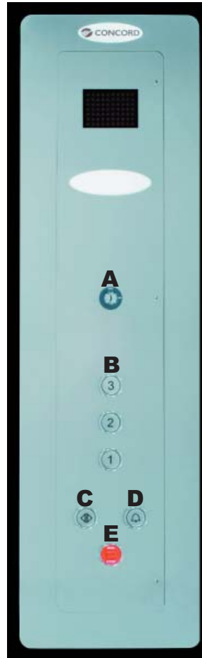
Figure 1 3 Stop COP Panel

The button can be set to Stop at any time to stop the cab and activate the alarm buzzer.